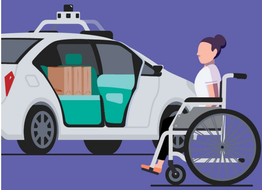
Pilot conducted with Nuro's Toyota Prius fleet