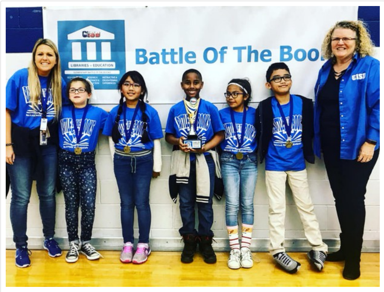
Dallas Park Elementary Third-Grade Panther Readers