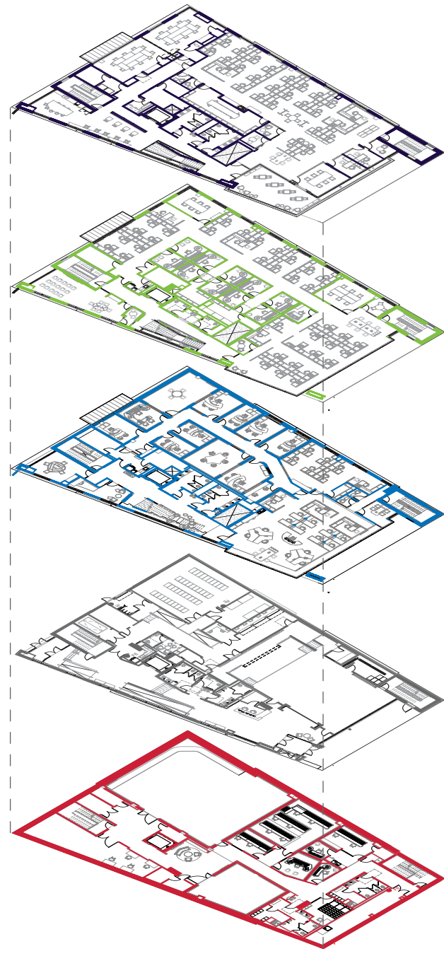
Plan Stacking Diagram