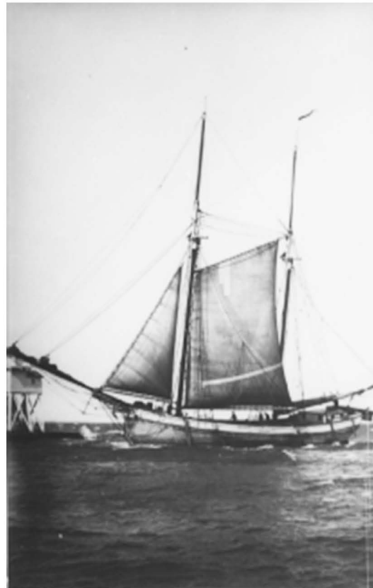
Ulster, 1874, Replica Exhibit Ship

The Ulster, built in 1874 at Milwaukee, and renamed the Helen in 1881, had a bow that was similar to the conventional schooner's in appearance. Two-masted, she measured 90' by 23' by 7', and 119 tons. The Ulster replica sits almost level with the gallery floor as to suggest the ability to walk on and in the vessel. The mast assembly is deconstructed and placed separately along the gallery floor.