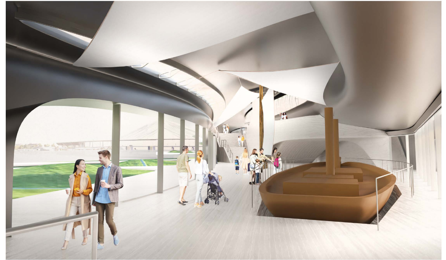
Gallery One Interior Vignette