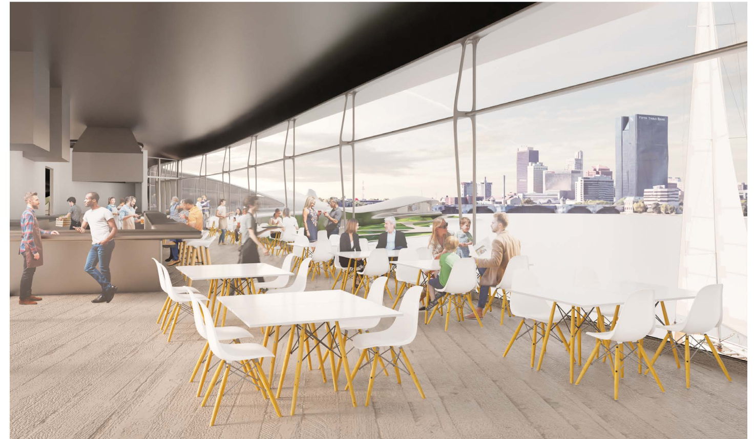
Restaurant Interior Vignette Looking Towards Downtown Toledo