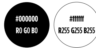
Black and White