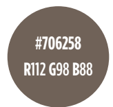
Warm Gray 11