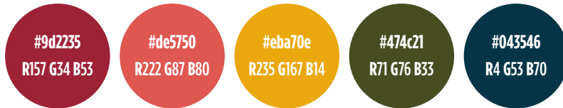
Standard Color Palette