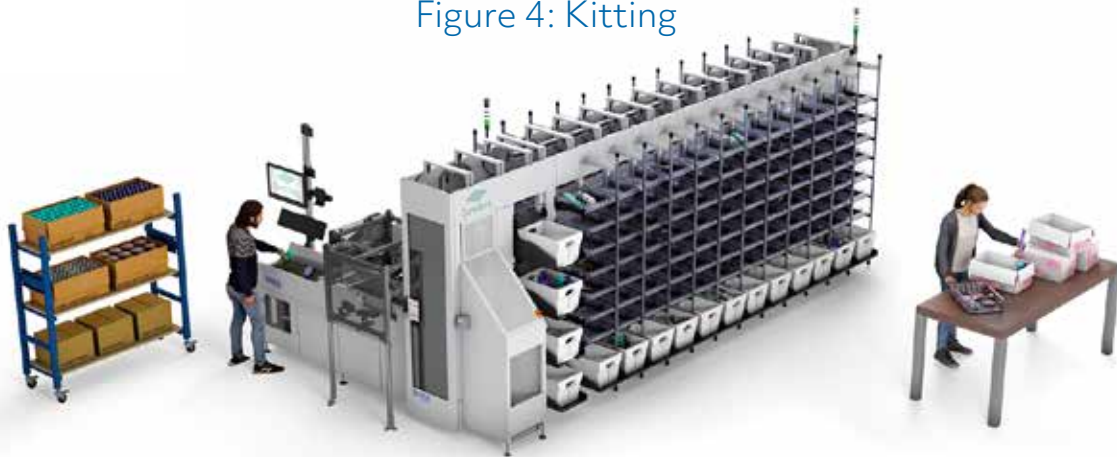
Figure 4: Individual pieces can be sorted into orders. In the diagram above, products are being sorted into orders, but kitting could include fulfillment of subscription box orders, or maintenance kits for field service personnel, for example.

In the above example, a sequence of containers, each containing a single item (e.g., body lotion, hand sanitizer, perfume, shampoo and conditioner) are received and their contents transferred to the conveyor.